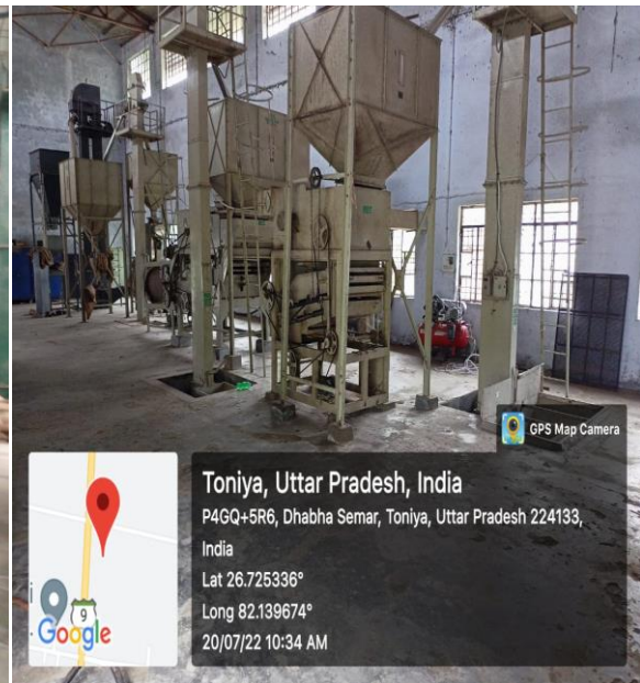
Seed Processing Plant